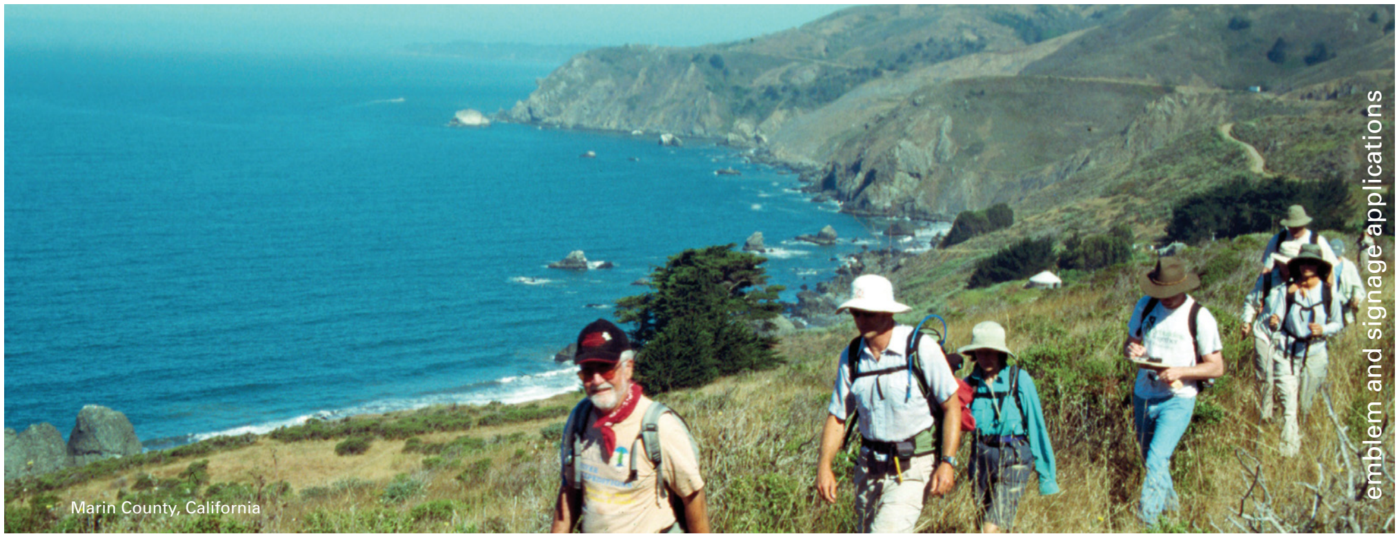
Marin County, California