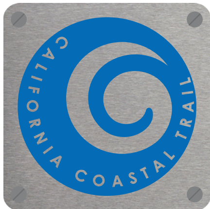
Version A: emblem on 7-gauge (0.1443 in.) brush finished aluminum