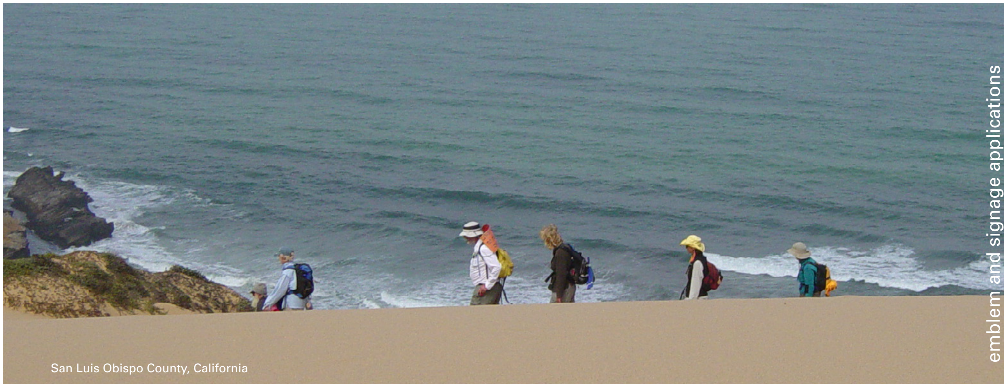
San Luis Obispo County, California