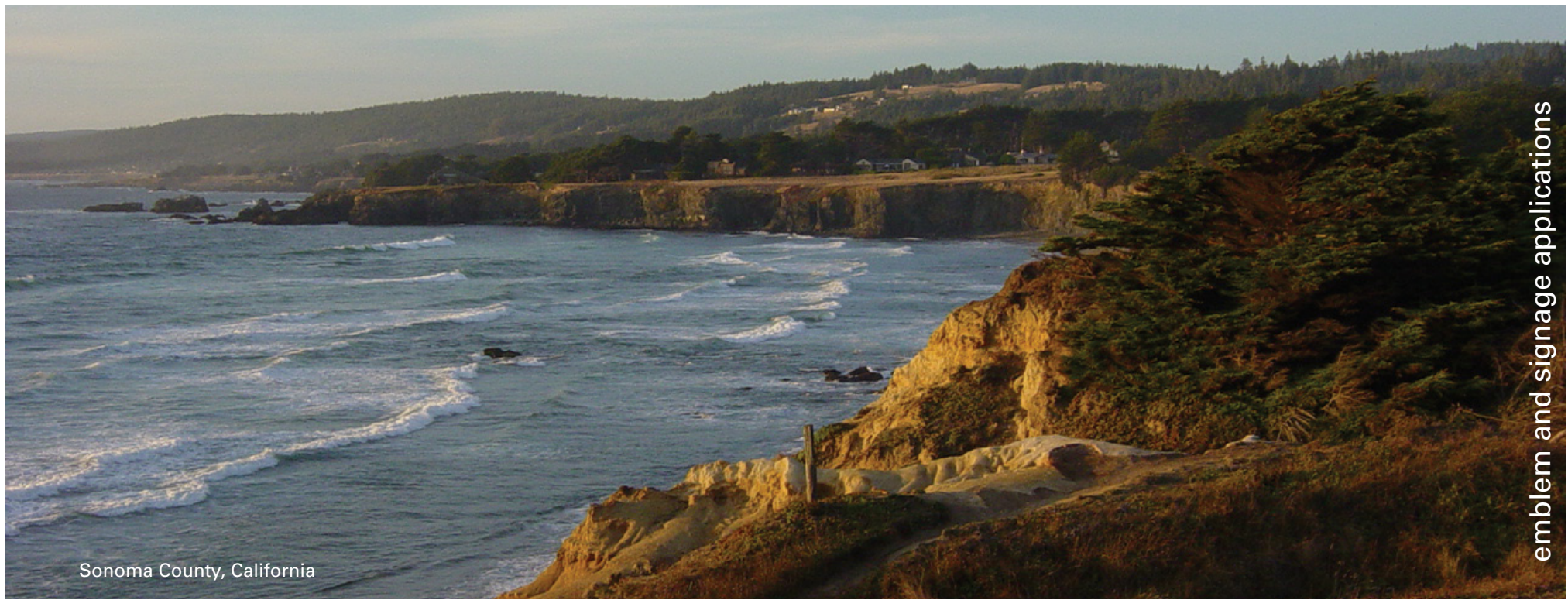
Sonoma County, California